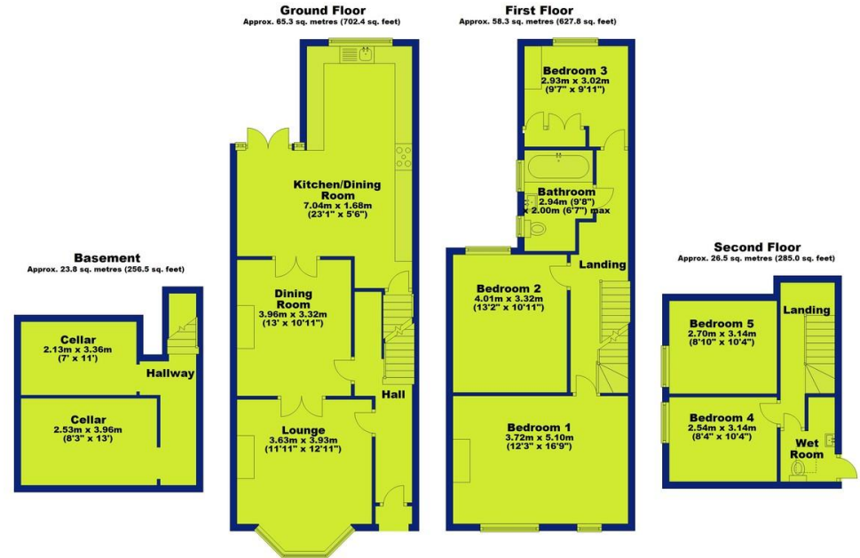
Total area: approx. 173.9 sq. metres (1871.6 sq. feet)

Interested? Call: 0115 8411 155 www.fhpliving.co.uk